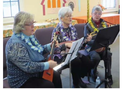
The Ukulele Ladies