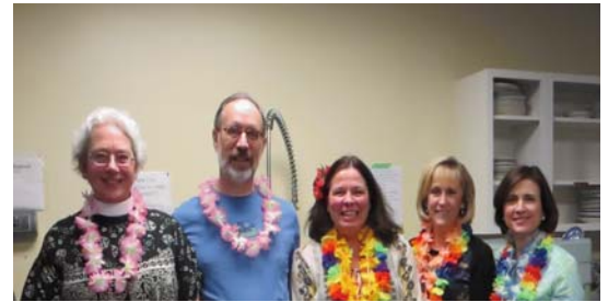
A few of the crew